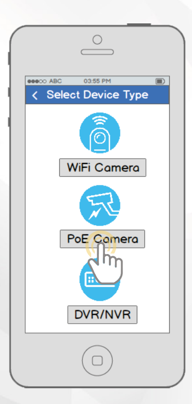
Tap "PoE Camera".