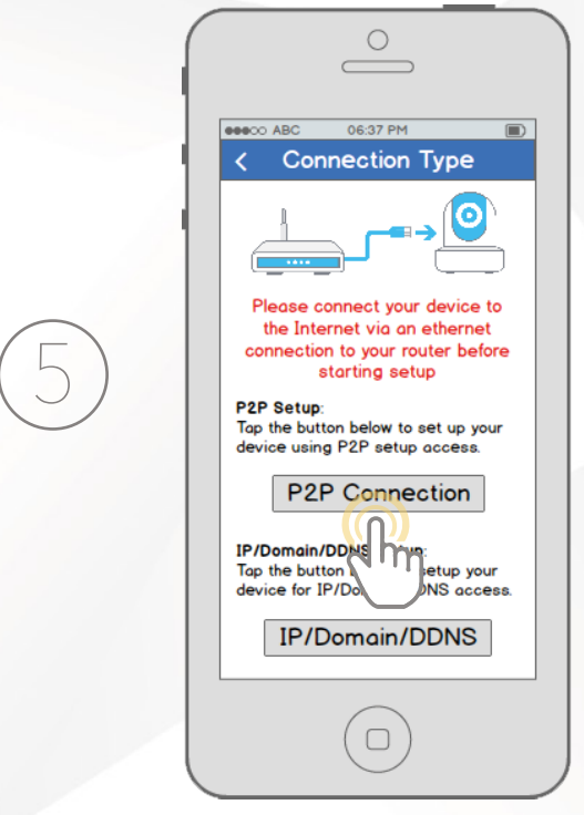
Tap the "P2P Connection"