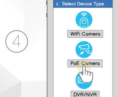
Tap "PoE Camera".